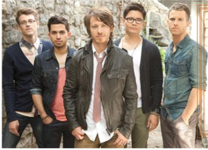
Tenth Avenue North At the Dayton Fair Monday August